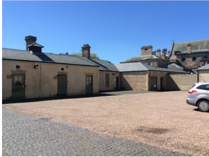
Image of stables courtyard ground 1