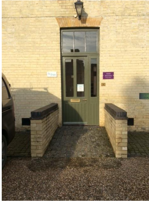
Image of external door leading to toilet 1