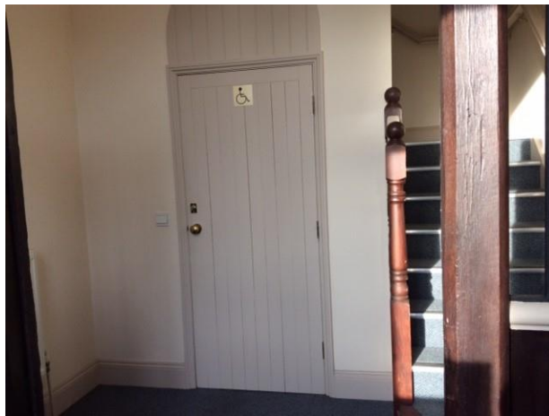
Image of door to accessible toilet 1