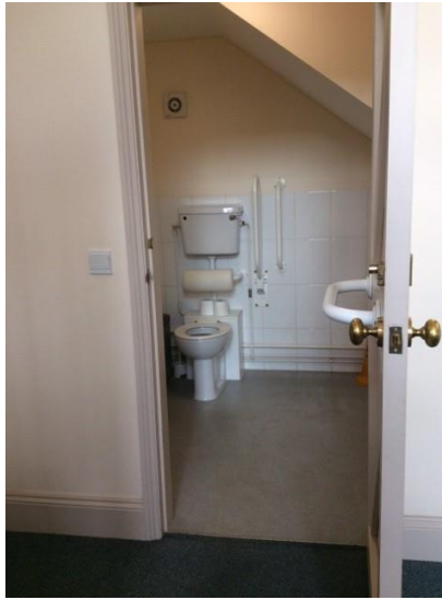
Image of accessible toilet 2