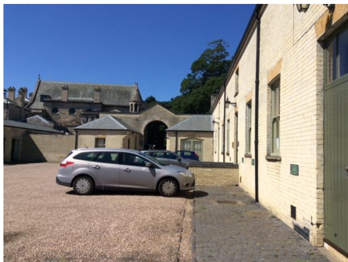
Image of car park 1

Photo taken from door on right with view of courtyard - access to toilets behind small wall behind great car