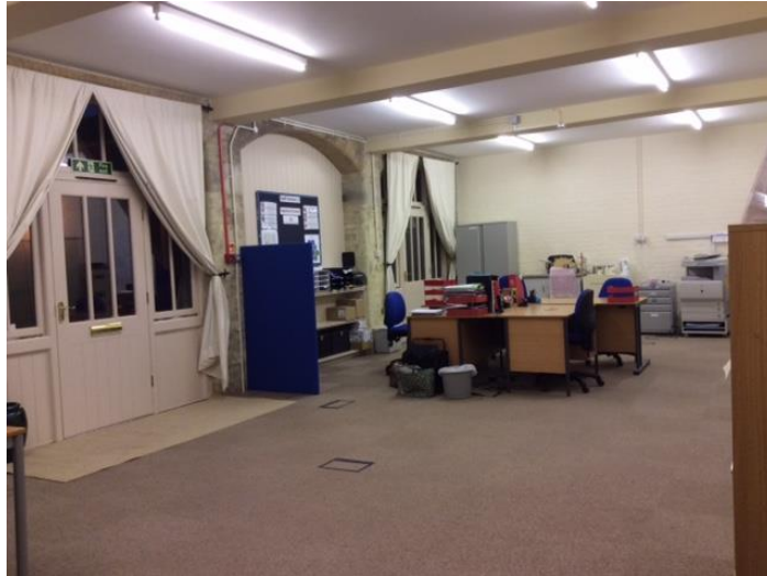
Image of inside main office 1

We have a main office and a side meeting room. The main office is fully accessible, however there is a single step down into the meeting room which does not have a ramp. Meetings can therefore be scheduled in the main office where appropriate.