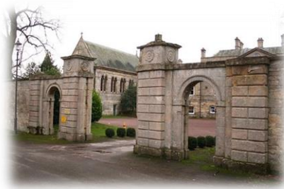
Image of gates to Wellingore Hall 1

You will find us in No 5, The Stables, to the left of the main hall