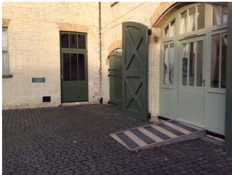
Image of ramp outside 5 the Stables 1

We have ramp access into our main office from outside.