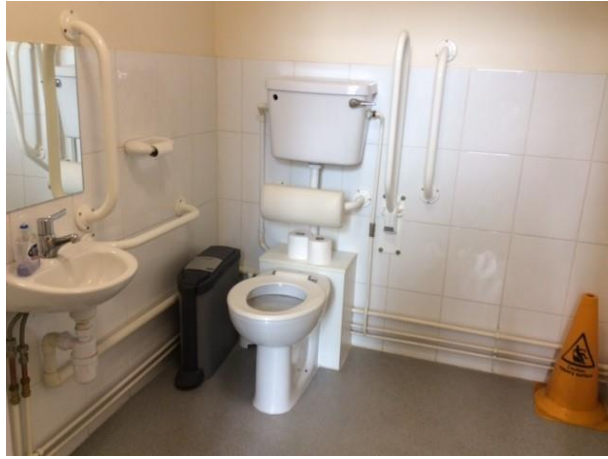
Image of accessible toilet 1