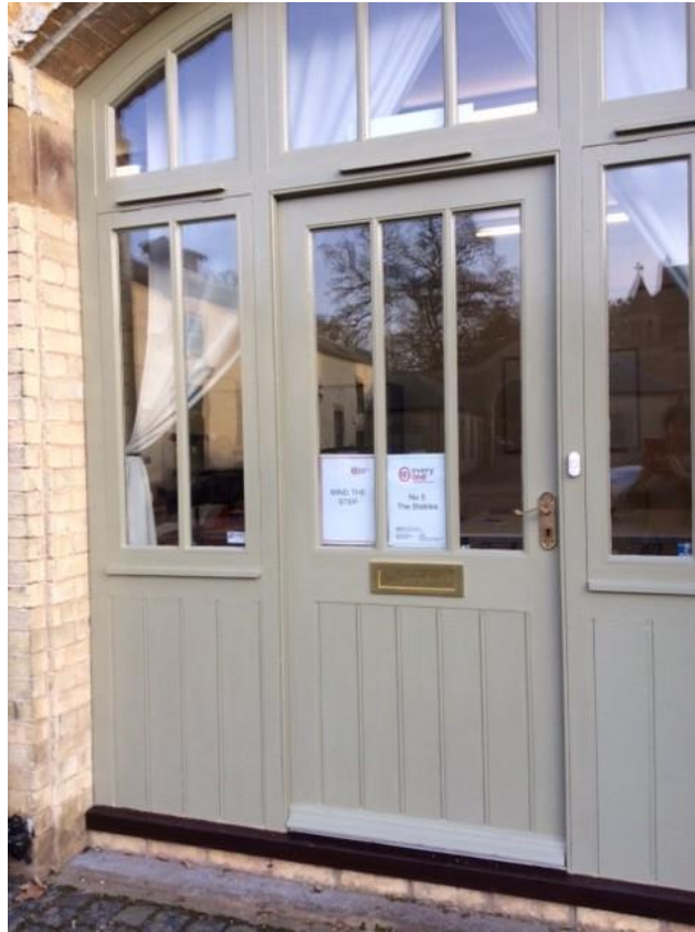
Image of office front door 1