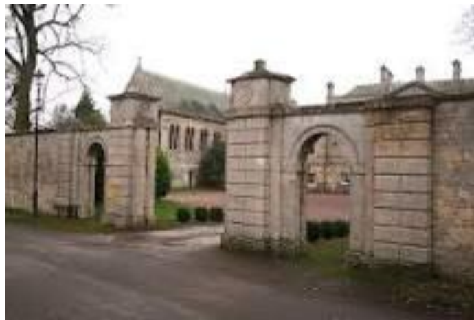
Image of Wellingore Hall entrance gates 1

There is also a second archway entrance further along the wall. Either entrance will bring you into our office area.