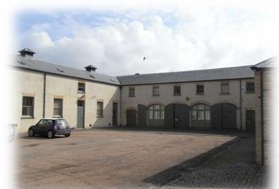
Image of stables courtyard 1