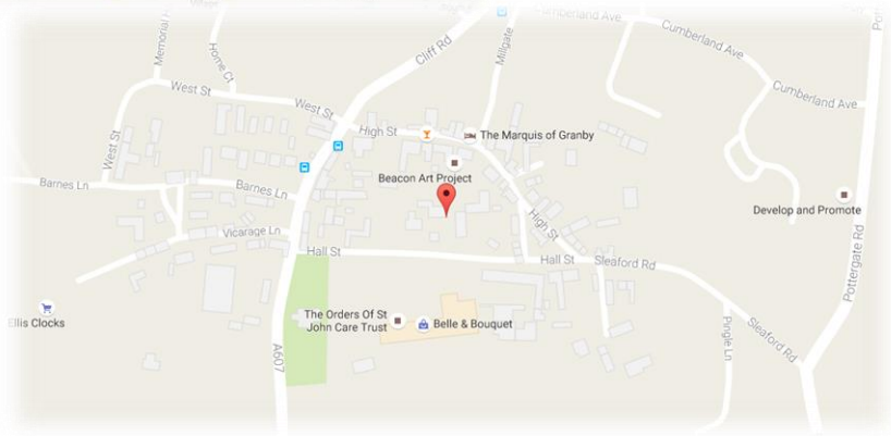
Map of Wellingore Village 1