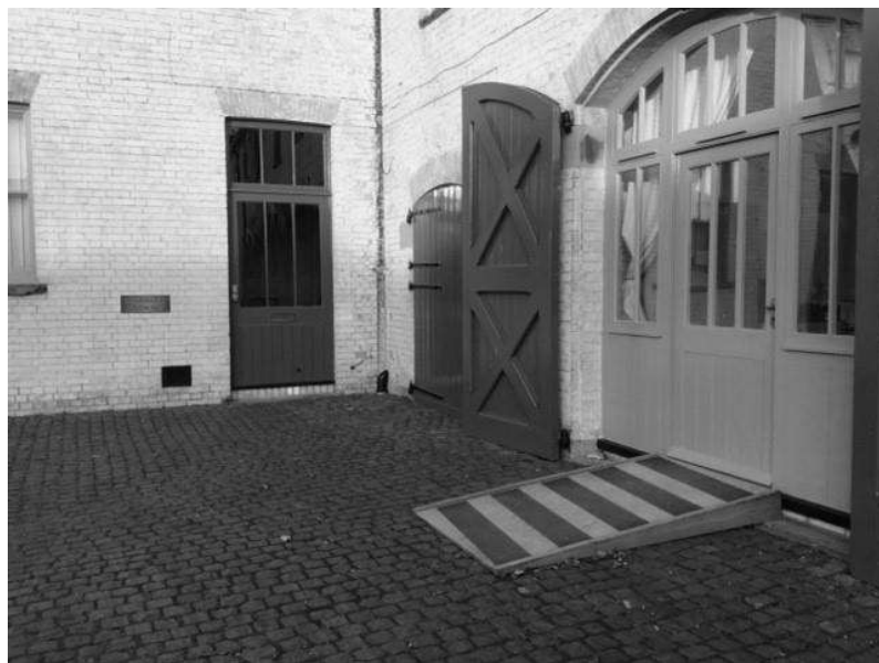
Image of ramp outside 5 the Stables 1