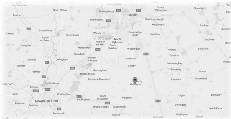
Map of Wellingore area 1

From Lincoln on the A607 travel through Wellingore village and turn sharp left into Hall Street, All Saints' Church is on the right hand side. From Grantham on the A607, enter Wellingore and turn right into Hall Street. All Saints' Church is on the corner and Wellingore Hall is a short distance down the street.