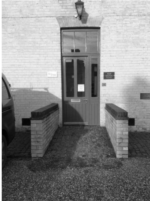
Image of external door leading to toilet 1