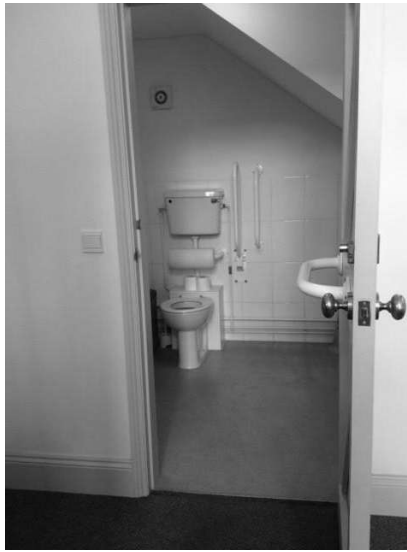
Image of accessible toilet 2