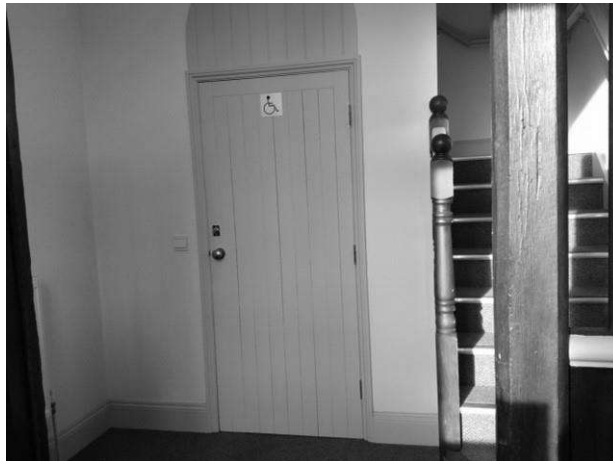
Image of door to accessible toilet 1