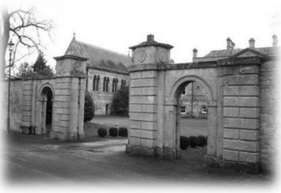
Image of gates to Wellingore Hall 1

You will find us in No 5, The Stables, to the left of the main hall