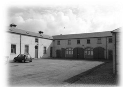
Image of stables courtyard 1