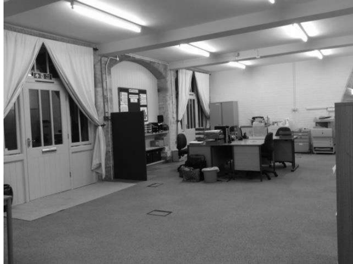
Image of inside main office 1

We have a main office and a side meeting room. The main office is fully accessible, however there is a single step down into the meeting room which does not have a ramp. Meetings can therefore be scheduled in the main office where appropriate.