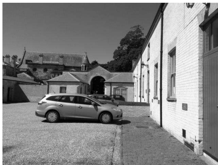
Image of car park 1

Photo taken from door on right with view of courtyard - access to toilets behind small wall behind great car