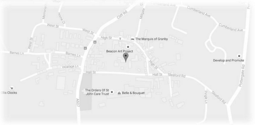
Map of Wellingore Village 1