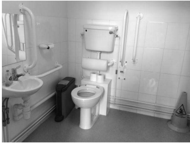
Image of accessible toilet 1