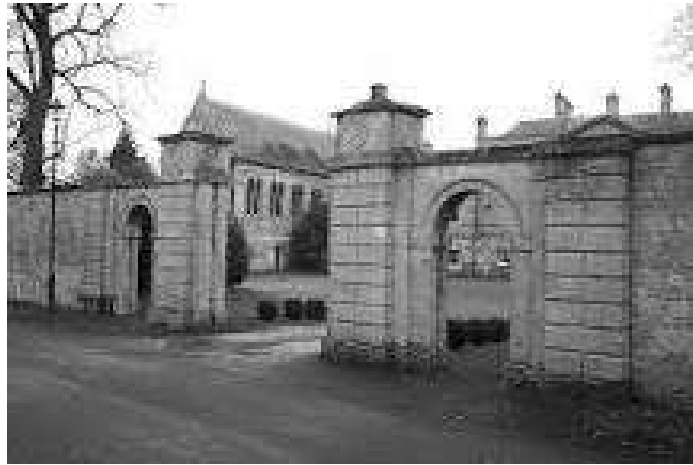
Image of Wellingore Hall entrance gates 1

There is also a second archway entrance further along the wall. Either entrance will bring you into our office area.