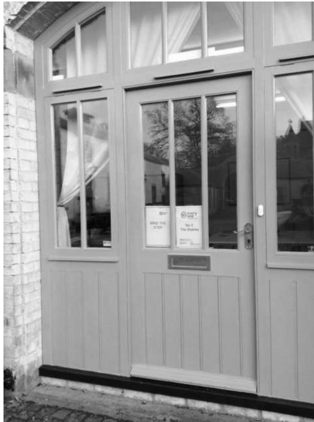
Image of office front door 1