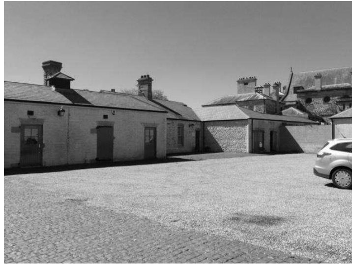
Image of stables courtyard ground 1